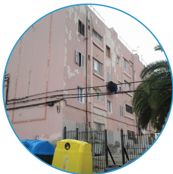
Current aspect of the neighbourhood