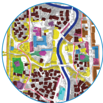
Space occupation diagnosis